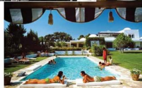
'Poolside in Sotogrande' from 'Poolside' classic collection by Slim Aarons. (American jet-setters and celebrities photographer, 1916-2006)