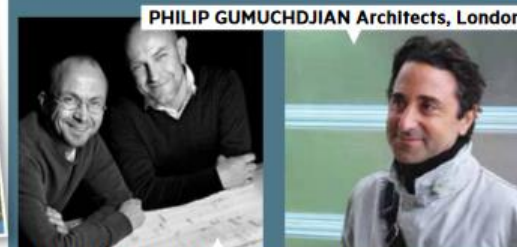
PHILIP GUMUCHDJIAN Architects, London