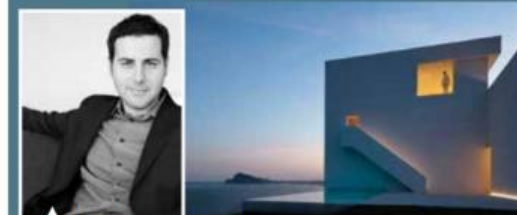
FRAN SILVESTRE Arquitectos, Valencia