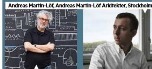
MARCIO KOGAN, STUDIO Mk27 São Paulo