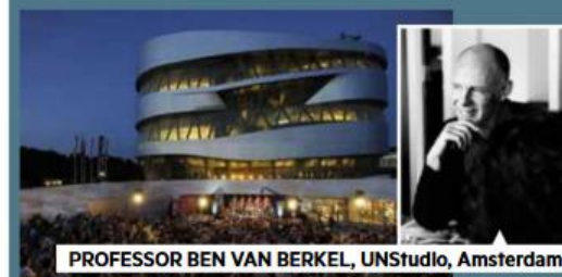
PROFESSOR BEN VAN BERKEL, UNStudio, Amsterdam